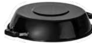
DOMES USAGE IS OPTIONAL