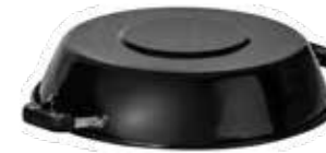
DOMES USAGE IS OPTIONAL